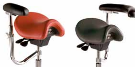
Please state the desired color and if the assembling is favored on the right or left side. Color samples available upon request.