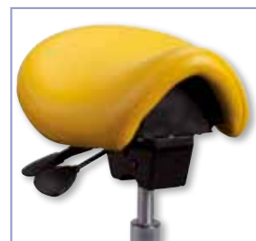
Colors and article numbers upon request